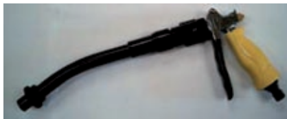
Topping up Gun (T.Gun Filler)