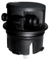
Single-point filling system