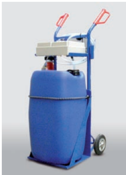
Battery topping trolley available in AC or DC